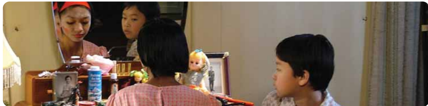
MY BEAUTIFUL RAMBUTAN TREE