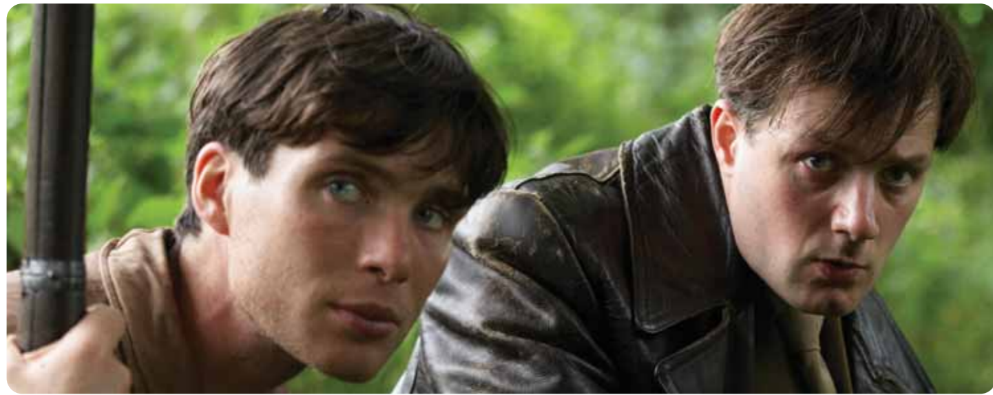
THE WIND THAT SHAKES THE BARLEY