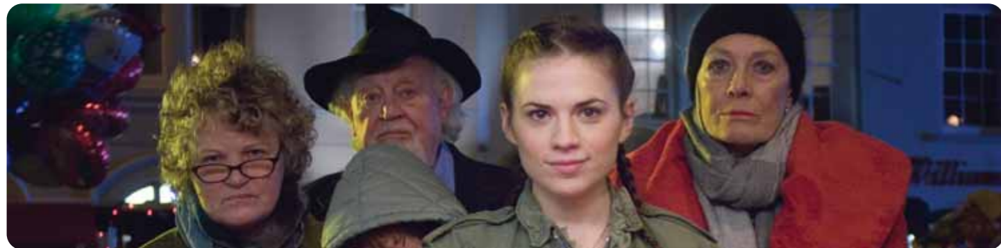
HOW ABOUT YOU