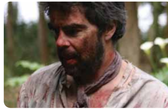
EXILE IN HELL