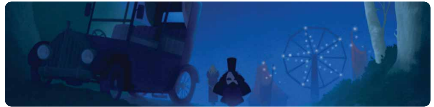
CARTE DE VISITE

** Áirítear anois costas na Tuarascála Bliantúla faoi Foilseacháin/Fógraíocht/ Caidreamh Poiblí.