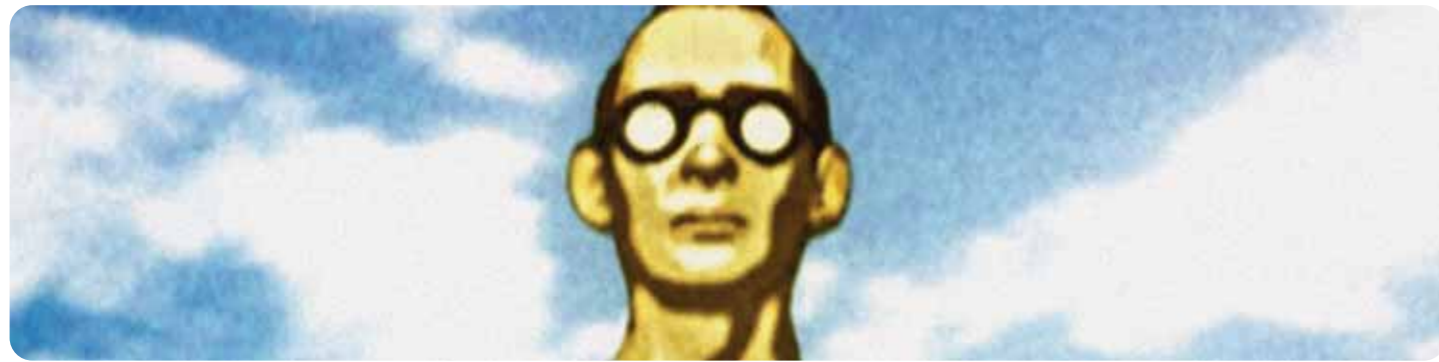
BUILDING A HOUSE