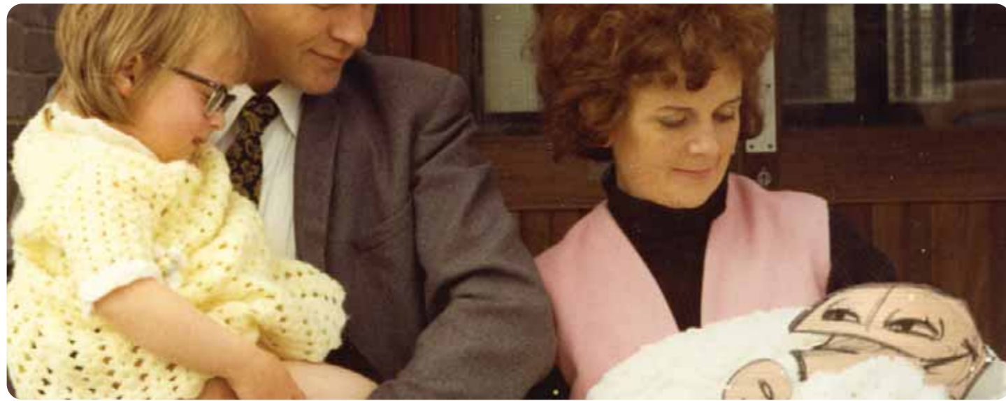
BADLY DRAWN ROY