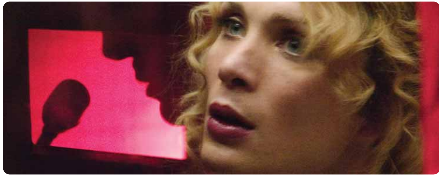
BREAKFAST ON PLUTO