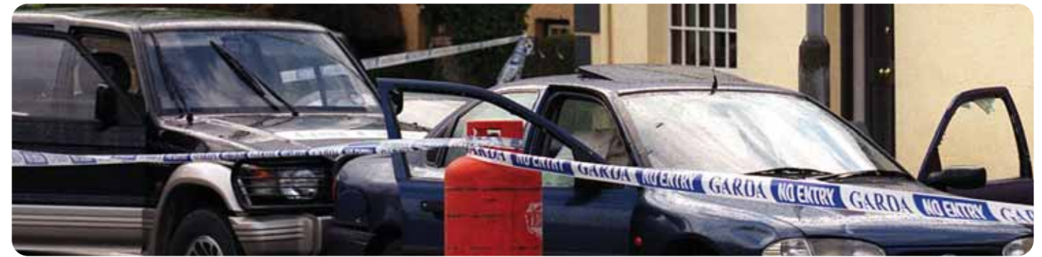
MURDER ON MAIN STREET

The Board terminated its lease in respect of its premises at Rockfort House in Galway in December 2006. In April 2006, the Board entered into a lease until 2016 in respect of its new premises at Queensgate, 23 Dock Road, Galway. The annual cost of this lease is €76,350 plus VAT. The Board also has commitments to the year 2011 in respect of the lease of office accommodation in Dublin at an annual cost of €63,486 plus VAT.