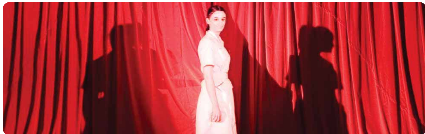
ONE HUNDRED TO ONE