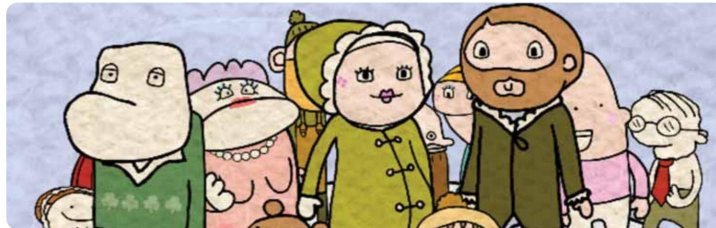
THE PARISH LETTER