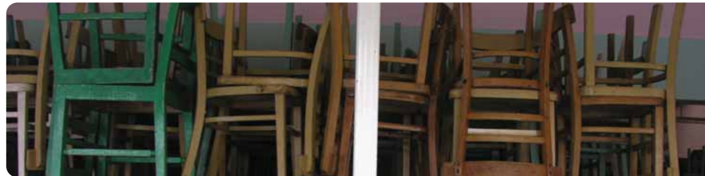
UISCE MARBH/STILL WATER