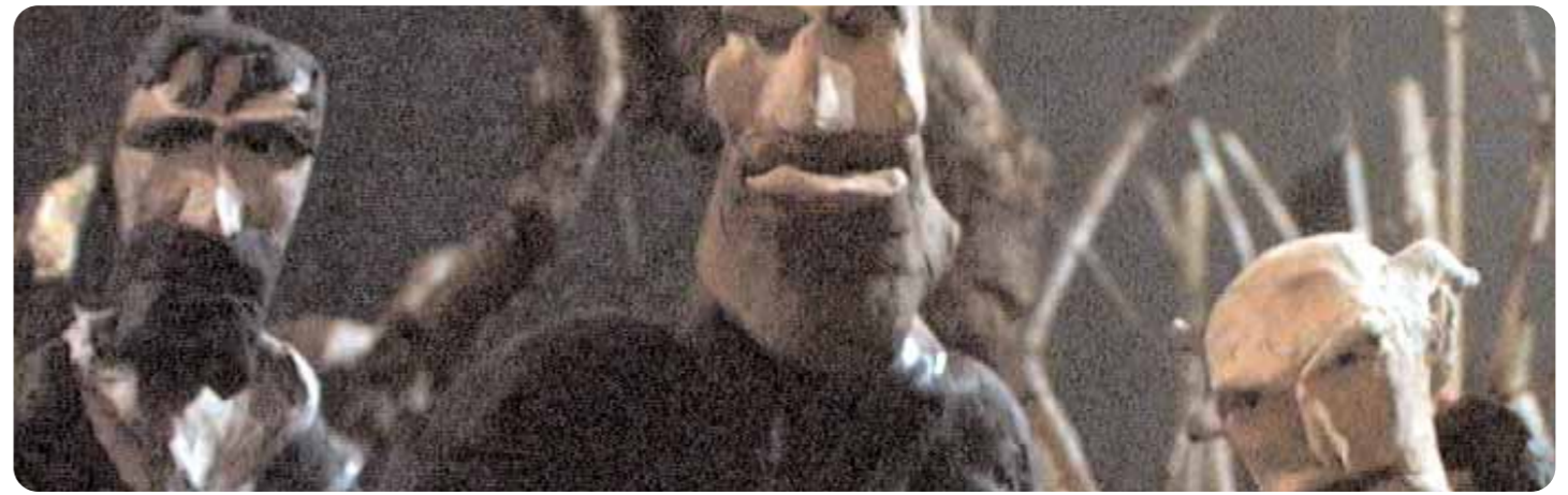
PULLIN' THE DEVIL BY THE TAIL