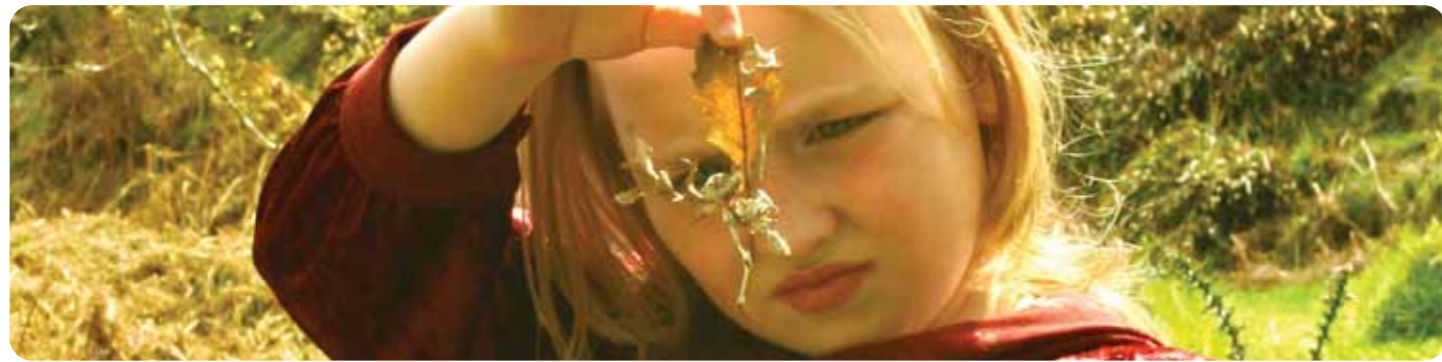
THE FÆRIES OF BLACKHEATH WOODS