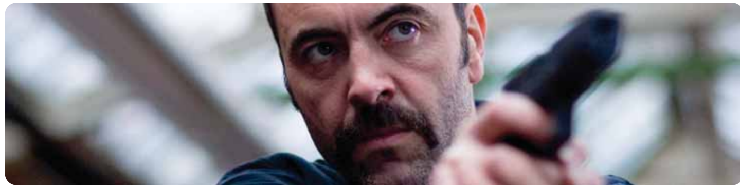
MURPHY'S LAW SERIES 4