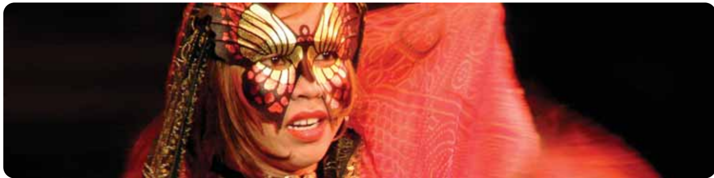
HERE TO STAY