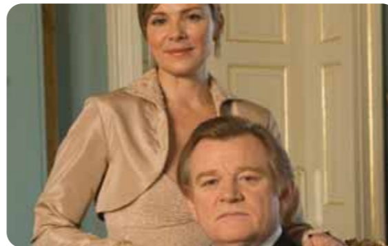
THE TIGER'S TAIL