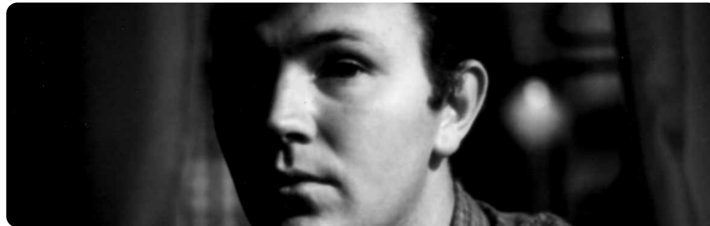
THE LEGEND OF LIAM CLANCY