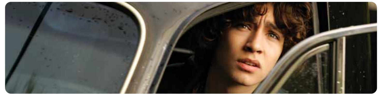
SUMMER OF THE FLYING SAUCER