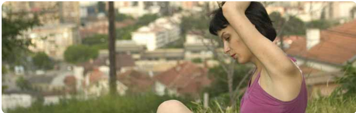
TONIGHT IS CANCELLED