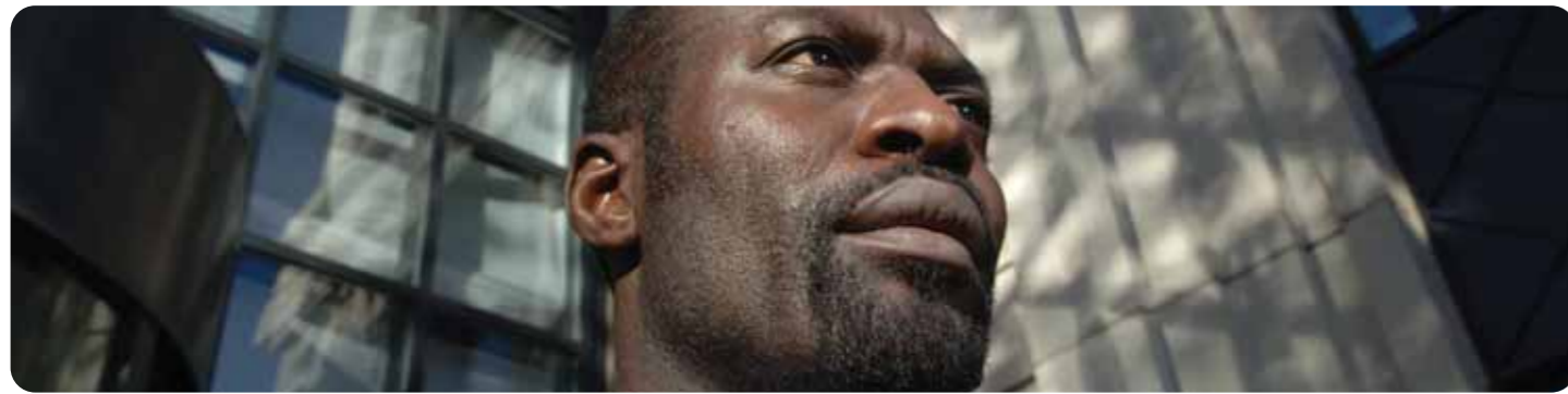
THE FRONT LINE