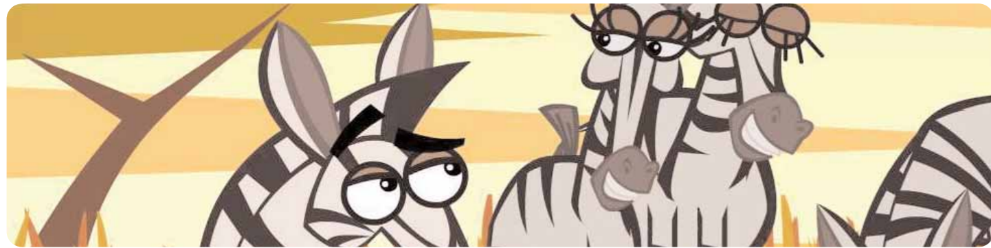
I'M AN ANIMAL