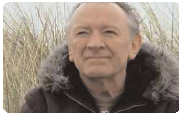
DÓNAL LUNNY: FOLLOWING THE MUSIC