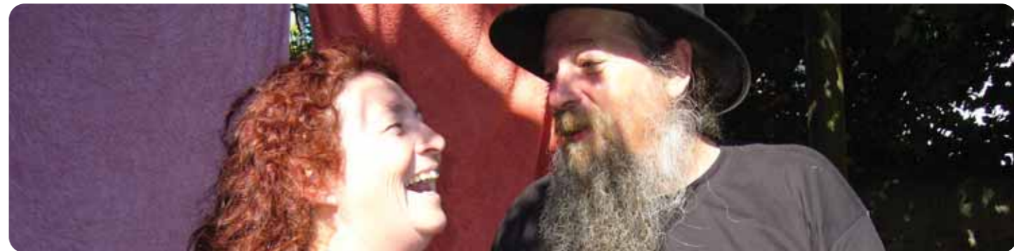
TOO LATE FOR THE EARLY HOUSE

Sa bhreis ar na tiomantais faoi chonradh a bhí gan íoc ag deireadh na bliana de €3,307,379 atá nochta bhí €6,062,112 breise i ndáil le hofráilacha sealadacha cúnamh amuigh. Tá cuid mhór de thiomantais mar sin, €4,500,000, i ndáil le léiriúcháin scannán áit a mbíonn ofráilacha faoi réir téarmaí agus coinníollacha áirithe lena n-áirítear foireann aisteoirí, criú, struchtúr earcaíochta agus airgeadais. Bíonn siad bailí ar feadh 12 mí agus ag an staid sin bíonn siad faoi réir athbhreithnithe. Bíonn na hofráilacha sin ag brath ar chistí an Bhoird a bheith ar fáil. Bhí ofráilacha neamhchanníochtaíthe cúnamh i ndáil le naoi léiriúcháin príomhscannán ag an mBord ag deireadh na bliana. Is dóchúil go bhfaighidh na tionscadail sin ofráilacha cainníochtaíthe i 2007.