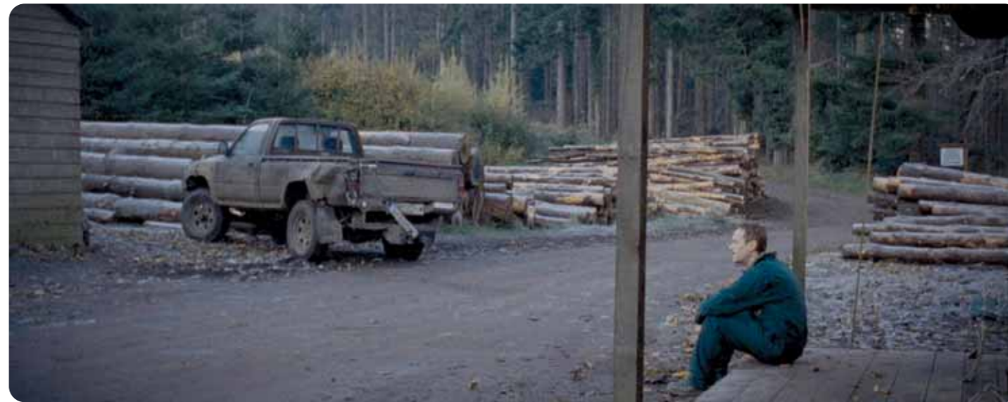
SMALL ENGINE REPAIR

Tá an Bord freagrach as leabhair chearta cuntasáochta a choinneáil a nochtáinn le cruinneas réasúnta staid airgeadais an Bhoird ag am ar bith. Tá sé freagrach as pé bearta is gá a ghlacadh le sócmhainní Bhord Scannán na hÉireann a chosaint agus le calaois agus mírialtachtaí eile a chosc agus a aimsiú.