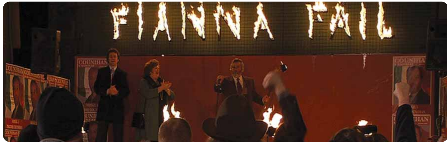
THE RUNNING MATE